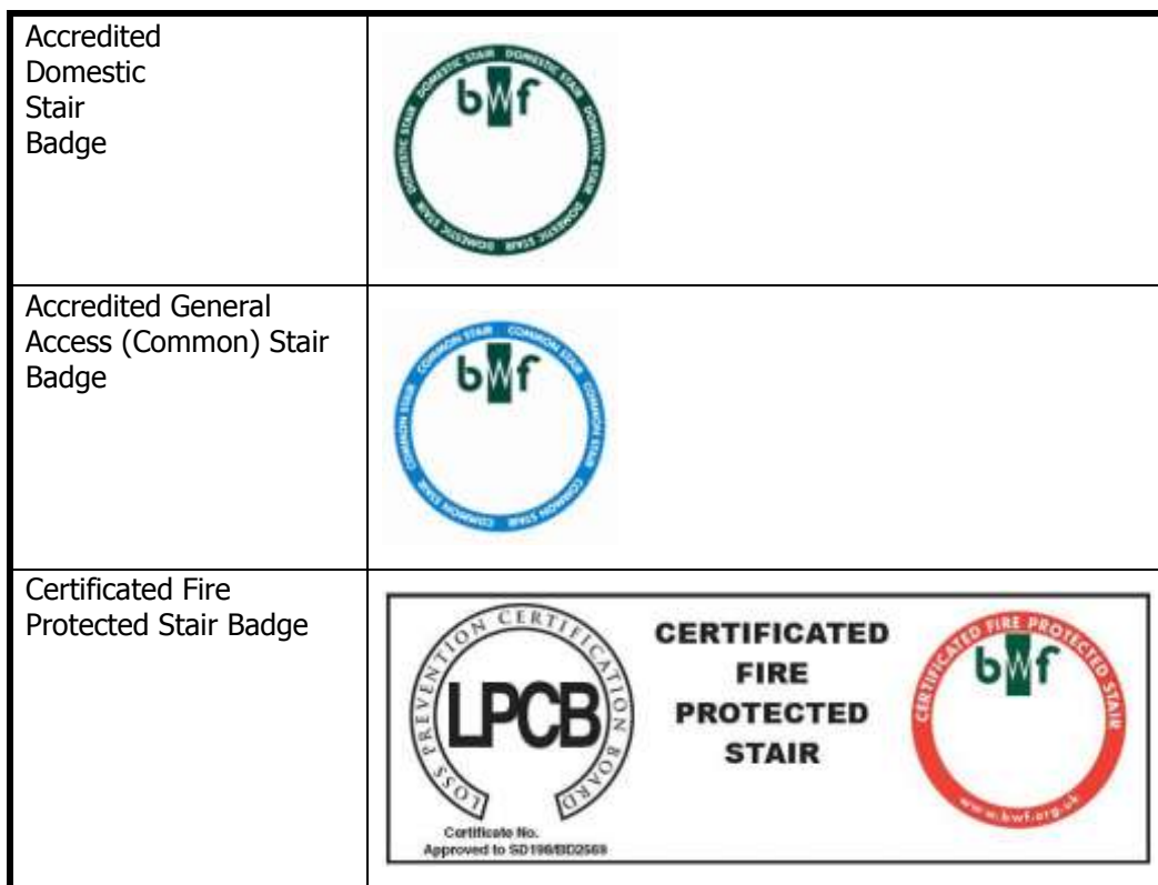
Table 1 – BWF Stair Scheme Badges

Each badge will be individually marked with the BWF logo, the manufacturer's name and a unique serial number allowing traceability.